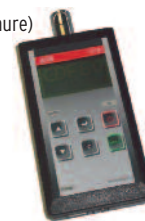
CDF 60 : LEAK FLOW CALIBRATOR